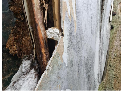
2350-2 Drywall/Joint Compound Typical Interior Walls/Ceilings