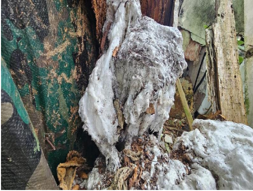
2350-1 Insulation Typical Interior