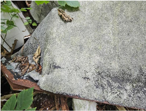
2350-3 Asphalt Shingle/Tar Typical Exterior Roof